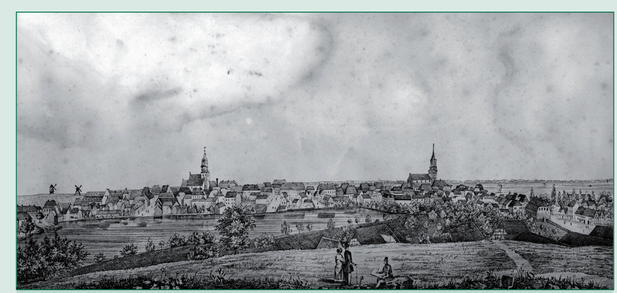
tich von Waren, um 1870

In the 14th and 15th centuries the Mühlenberg, sited on sandur ground, was an important windmill location for the town. As early as 1846 it was to be fashioned into a park and embellished through planting according to the plans of the Schwerin court gardener Theodor Klett owing to its magnificent views onto the town and the Müritz. The project was implemented by the town improvement association founded with the collaboration of Mayor W.C.L. Schlaaff in 1866. In 1870 the first town park in Mecklenburg came into existence.