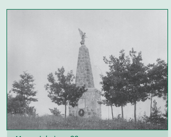
Memorial, circa 1880

The 1887 memorial on the Mühlenberg dedicated to the fallen of the Waren district in the Franco-German War of 1870/71 is crowned with a goddess of victory designed by the Schinkel pupil C.D. Rauch.