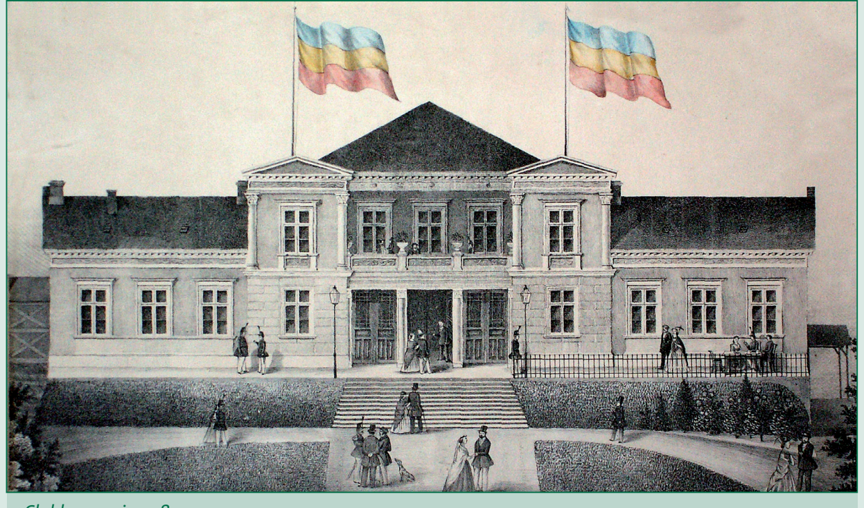
Clubhouse, circa 1875

The shooting guild inaugurated their new clubhouse here in 1871. As well as the annual shooting fairs, private dances, society parties and political assemblies frequently took place here. When the guild was dissolved after the 1943 shooting fair the building lost its original significance.