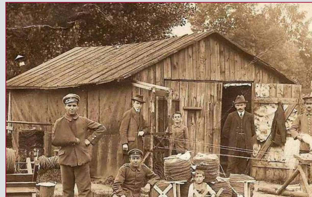
Rope-walk with wood chips in Gießen – around 1915

This led to a curious situation, whereby the geographical centre of the town was now situated on an area of land that was „unfit for construction“. While it is easy to make out traces of the original ropewalk, the site was relatively undeveloped until a playing field and fairground area were created, followed in recent years by parking spaces and surrounding developments. Clearly, therefore, Waren had its own „Reeperbahn“ too, much like the one in Hamburg.