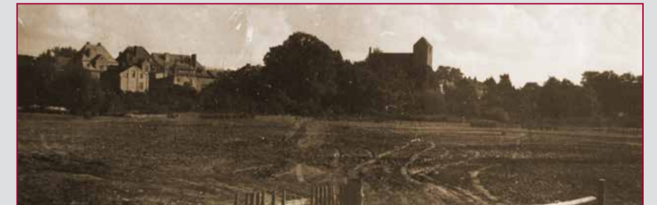
View from Stiefmöh towards Georgenkirche

The railway first crossed the lowlands in 1879. Construction on Kietzstraße, heading west from the bridge crossing the canal between Herrensee and Müritz, began in 1889, followed a year later by the laying of Goethestraße – or Bismarck-Straße as it was known at the time.