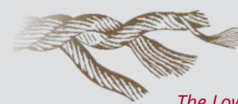
The Low German word for rope is „Reepe“

This led to a curious situation, whereby the geographical centre of the town was now situated on an area of land that was „unfit for construction“. While it is easy to make out traces of the original ropewalk, the site was relatively undeveloped until a playing field and fairground area were created, followed in recent years by parking spaces and surrounding developments. Clearly, therefore, Waren had its own „Reeperbahn“ too, much like the one in Hamburg.