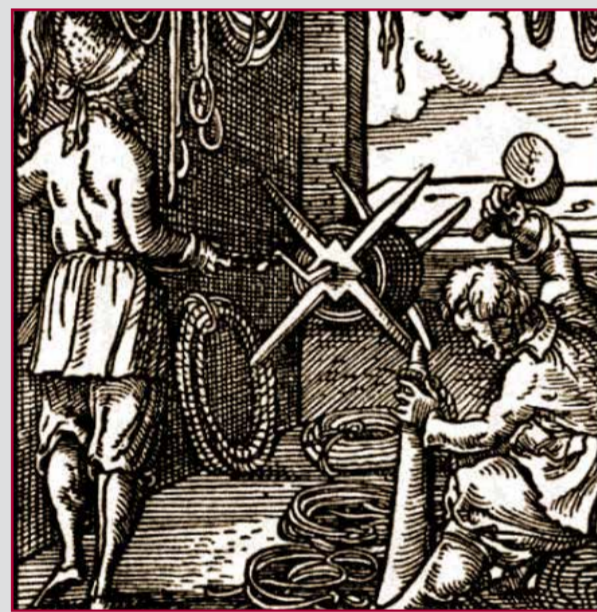
Flax breaks and hatchels (also known as heckling combs) were used to prepare the hemp and flax before the rope-makers could begin weaving threads or ropes. Because of how long a rope-walk needed to be, they were generally set up at the edge of or even outside the town.

Later, lines known as „Reeps“ that were used for mooring ships were in less demand than simple rope, cord and string of differing strengths. After the town was rebuilt following the devastating fire of 1699, many of Waren's rope-makers also returned to their craft, a trend that continued into the 1920s.