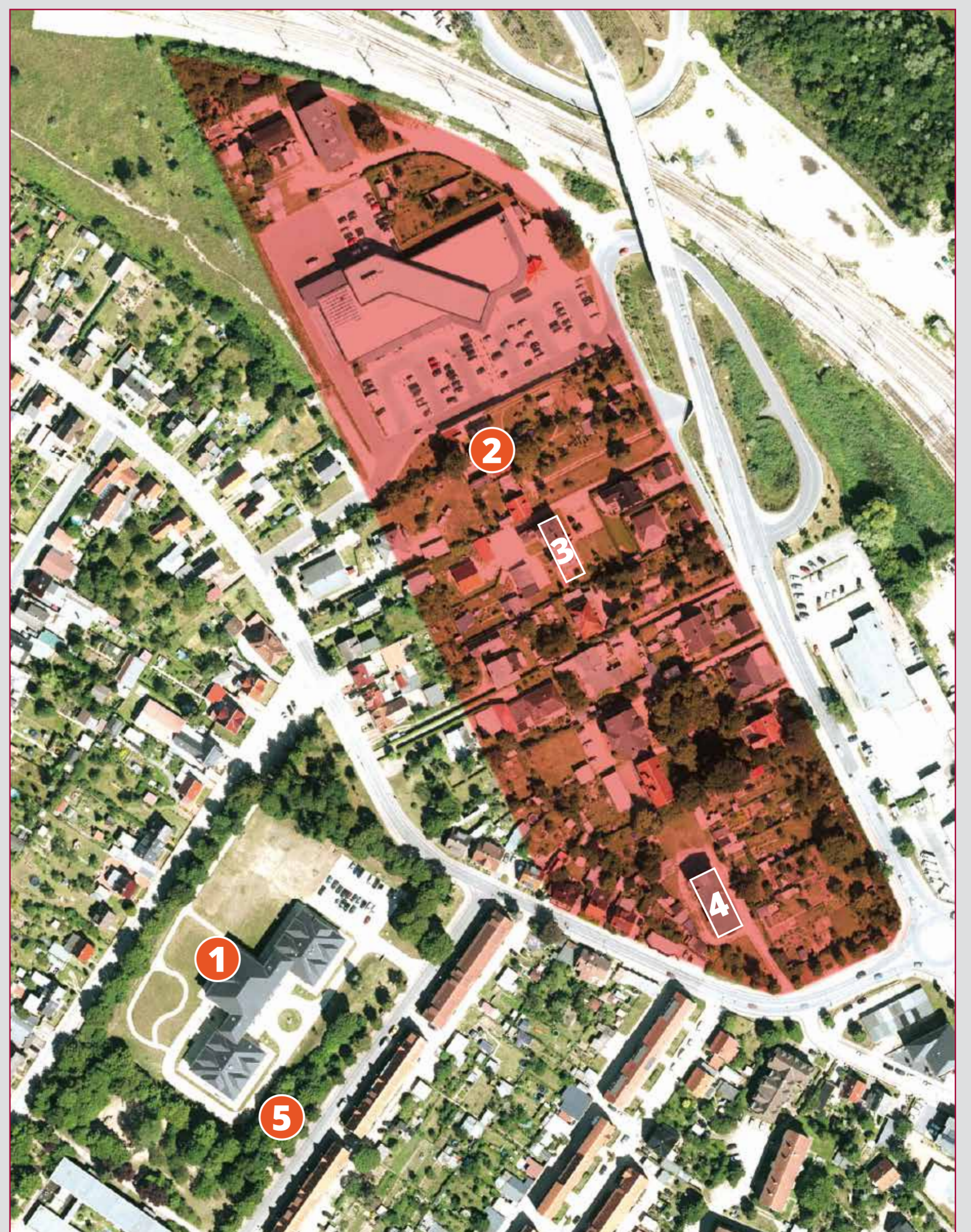
former factory site (red) - (Point 5) indicates their current location