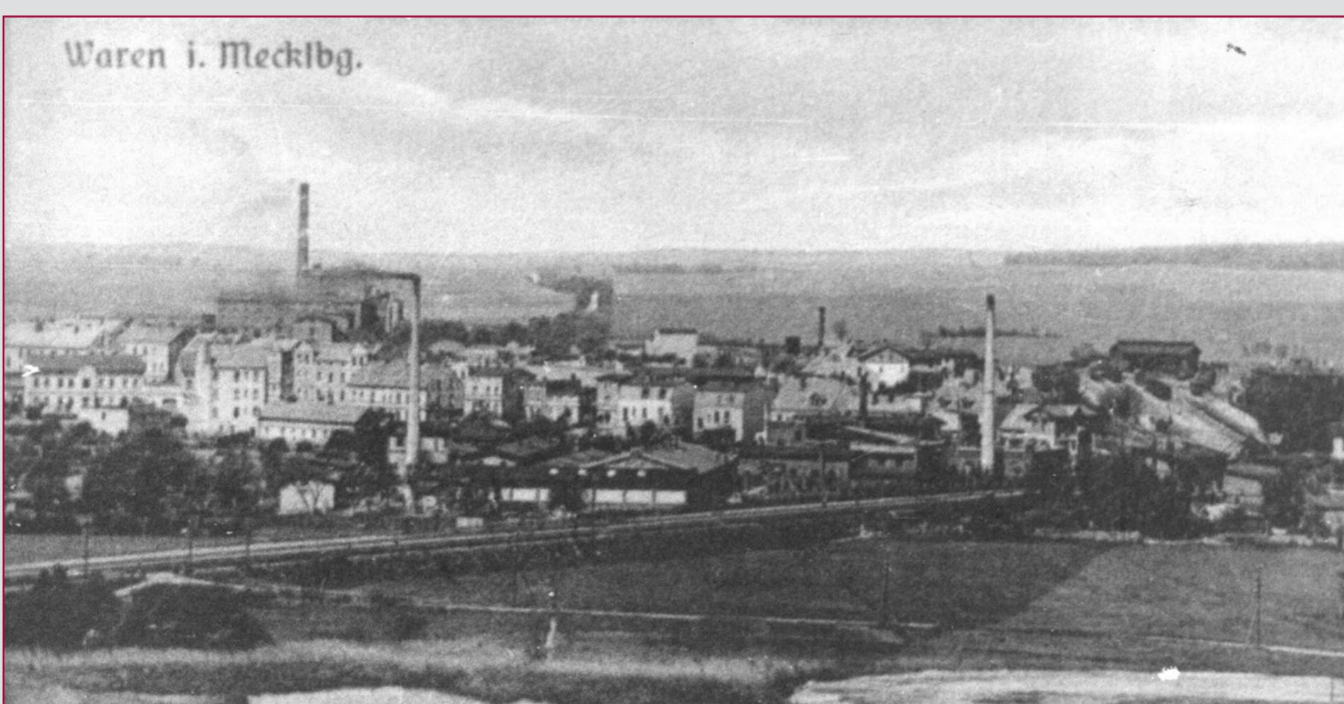
View of the factory site ca. 1900