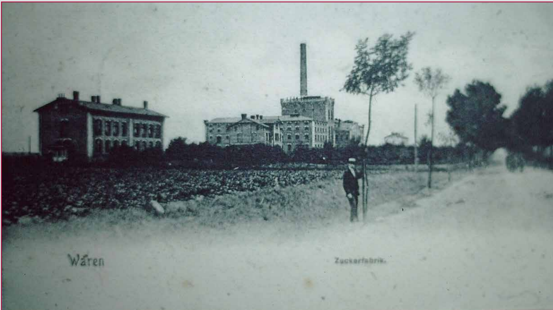
Factory site ca. 1900