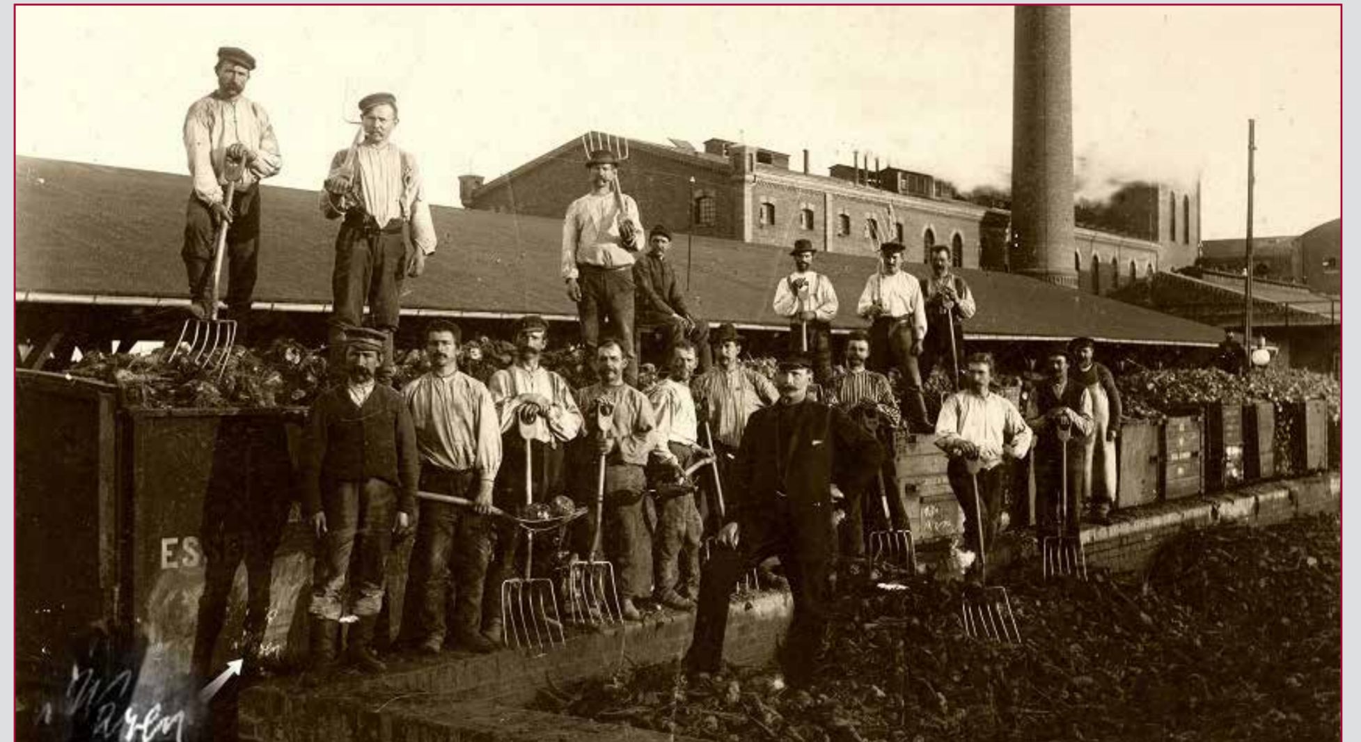
These so-called itinerant labourers were only employed when needed.

Plans to build a sugar refinery in Waren (Müritz) were approved and implemented in 1892. Construction cost 1 million Marks. The factory became operational on 3 October 1893.